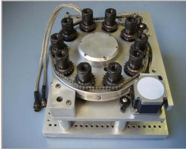
10 Spindle Carousel - Vertical View